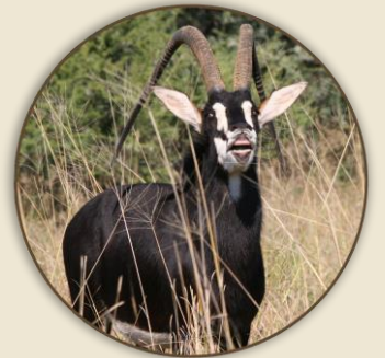
Flare 50 4/8"