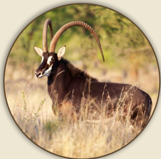
Piet 53 6/8"