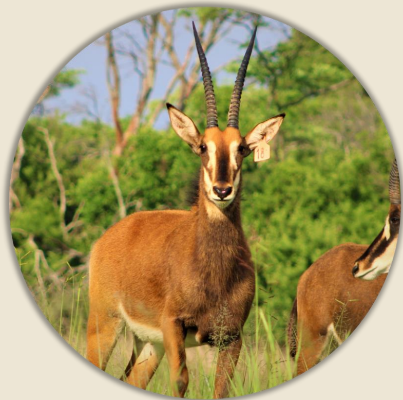
Pink 18 21 6/8" (GAMELAB) at 2y 4m