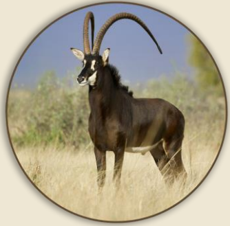
SummerTime 52 6/8"