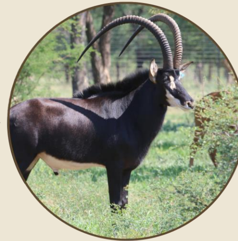
Sire: BZN 51 6/8”

Click here to view full genetics in catalogue