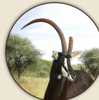
Dam's Sire's Sire: Rapella 52 4/8"