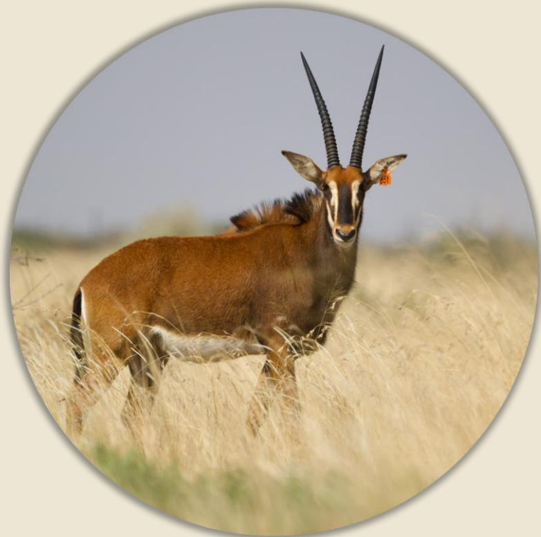
O851 24 4/8" at 2y 8m