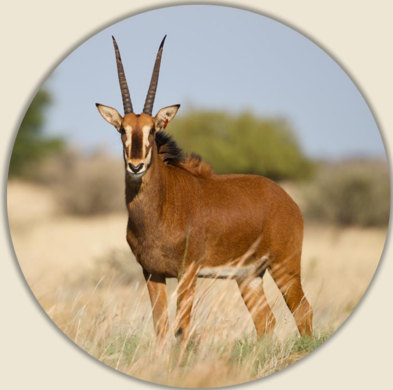
O928 20" at 21m