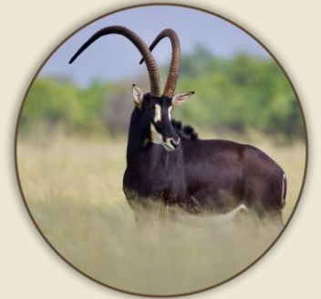
Bismark 50 2/8"