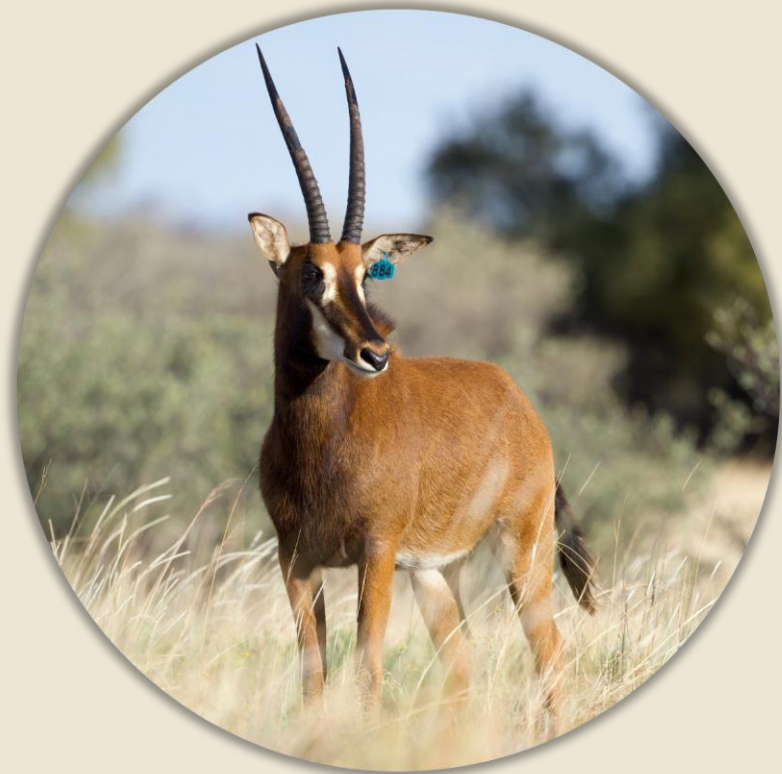
B884 22 6/8" at 2y 2m