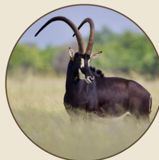
Sire: Bismark 50 2/8"