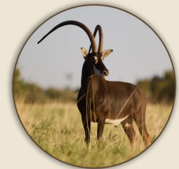
Certified In Calf To: Warren 52"

Click here to view full genetics in catalogue