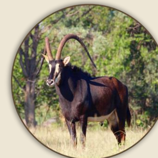
Running With: Namwala 50 4/8"

Click here to view full genetics in catalogue