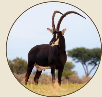
Running With: Tequila 49"

Click here to view full genetics in catalogue