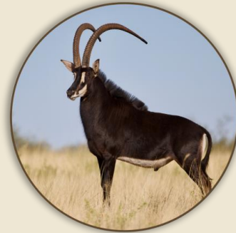
Otjiwa 51 4/8"