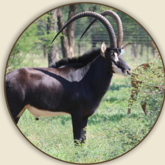
BZN 51 6/8"