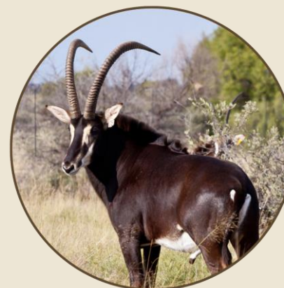
Sire: Black Jack 44 4/8"