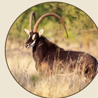
Sire's Dam's Sire: Piet 53 6/8"