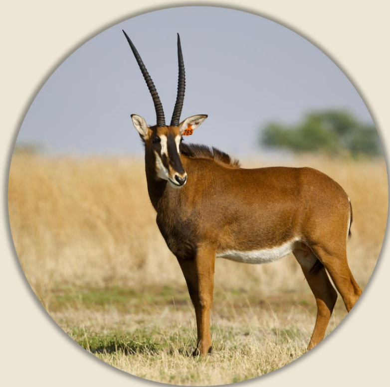
O765 25 6/8" at 3y 2m