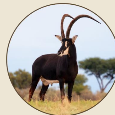
Dam's Sire: Tequila 49"