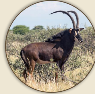
Hercules 50 6/8"