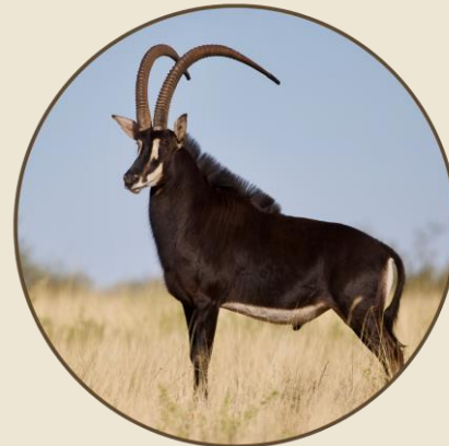
Sire: Otjiwa 51 4/8"