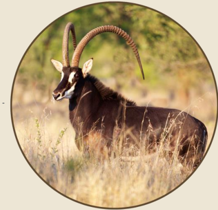
Sire's Sire: Piet 53 6/8"