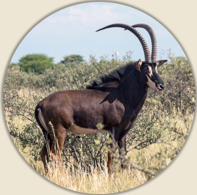
"Hercules" P57 50 6/8" at 5y 5m