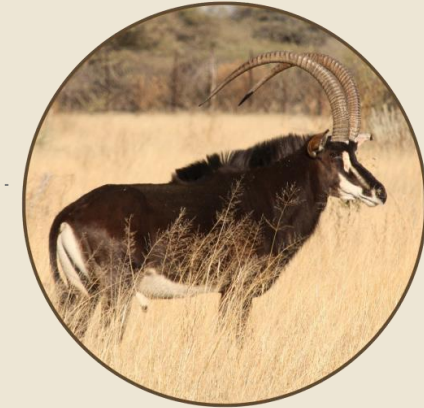
Sire's Sire: Gladiator 51"