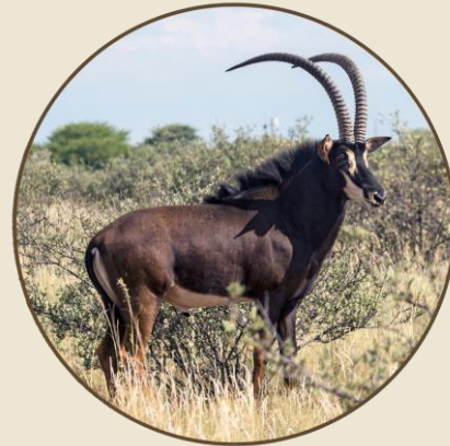
Sire: Hercules 50 6/8"