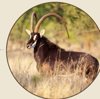
Sire's Sire: Piet 53 6/8"