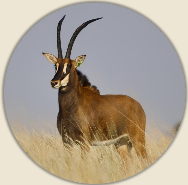
"Ivanka" L539 32 2/8" at 5y 1m