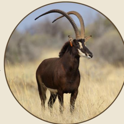
Sire: DoubleUp 48 3/8"