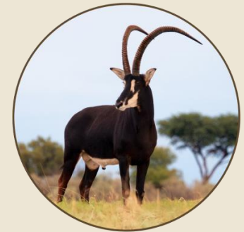
Running With: Tequila 49"

Click here to view full genetics in catalogue