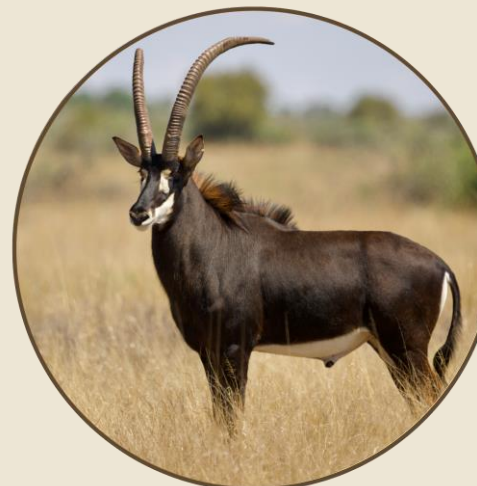
Sire: Explorer 48 5/8"