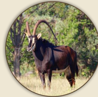
Namwala 50 4/8"