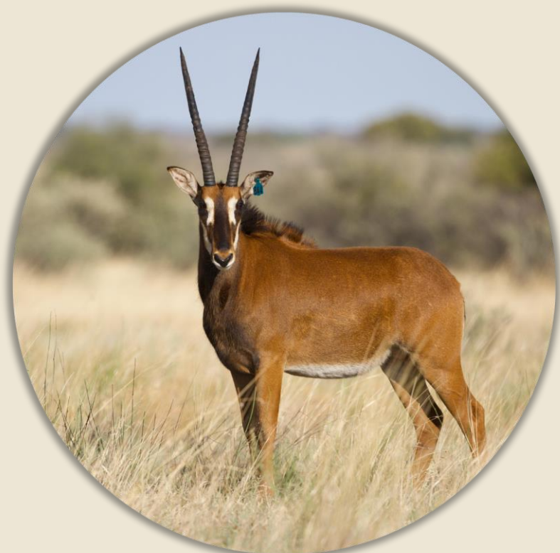
B844 25" at 2y 5m