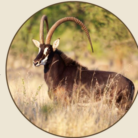
Sire: Piet 53 6/8"

Click here to view full genetics in catalogue