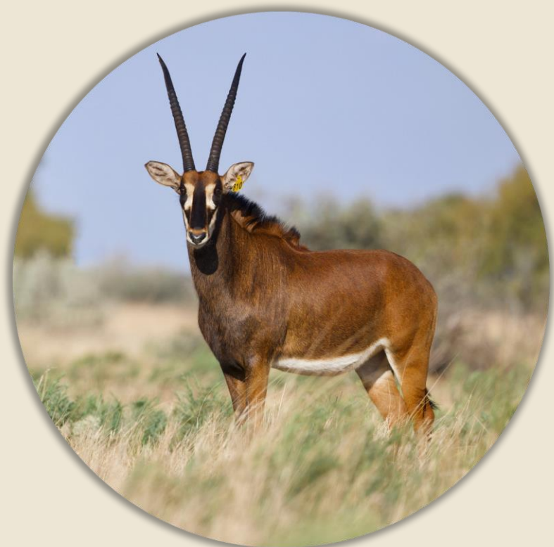
Y810 25 4/8" at 2y 9m