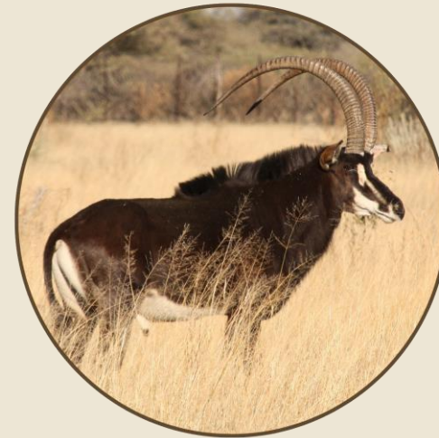
Sire: Gladiator 51"