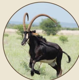
Sire's Sire: Charlie 51"