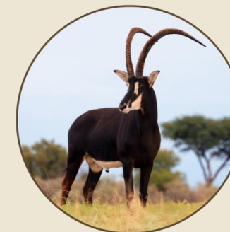
Running With: Tequila 49"

Click here to view full genetics in catalogue