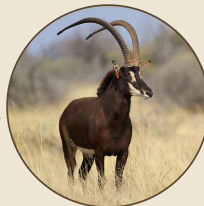
Sire: DoubleUp 48 3/8"