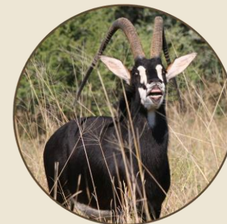
Dam's Sire's Sire: Flare 51"