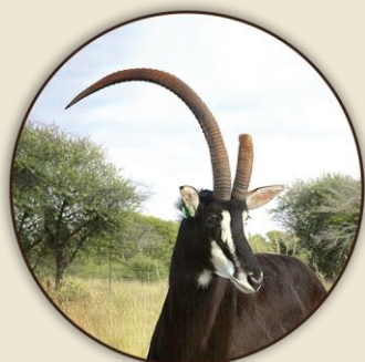
Rapella 52 4/8"