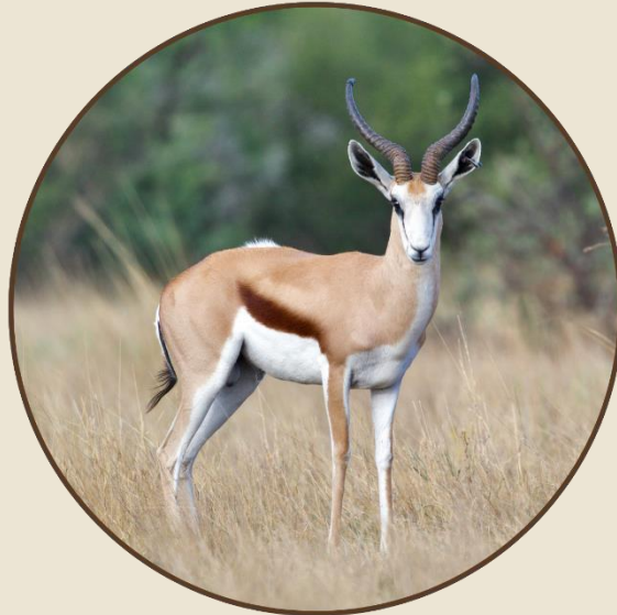
Lot: 286 P2 18" at 3y