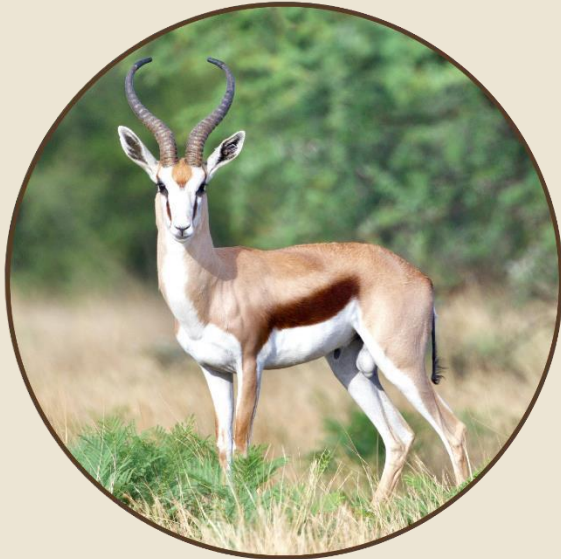
Lot: 034 Theron P1 18" at 2y 6m