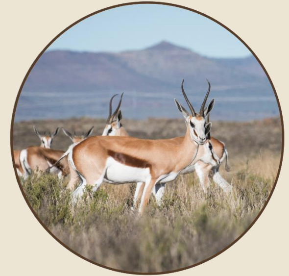
Lot: 248 & 296 Springbuck Ewes 10"+ & 11"+