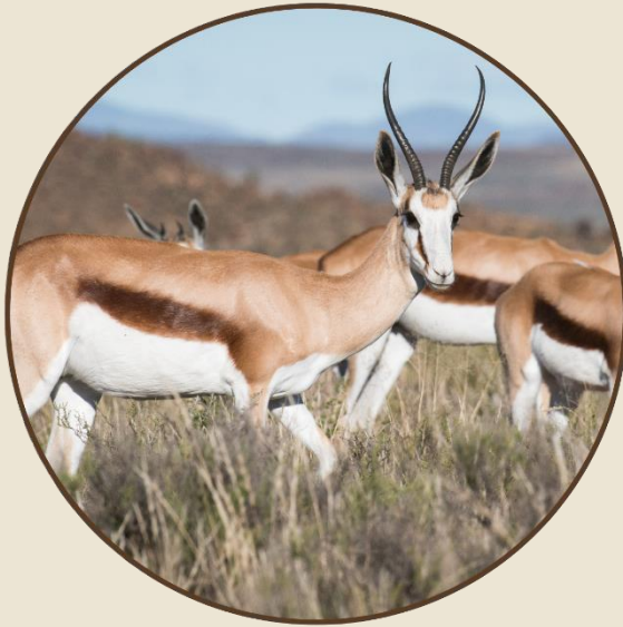
Lot: 206 Springbuck Ewes 11"+