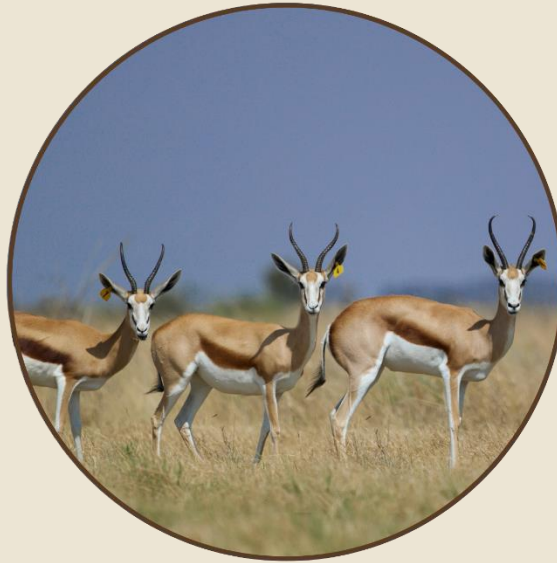
Lot: 233 Springbuck Ewes 11"+