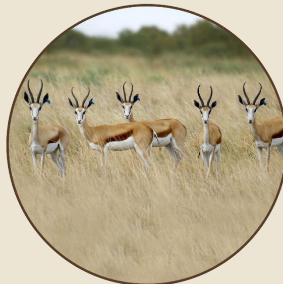
Lot: 019 & 214 Springbuck Ewes 12"+