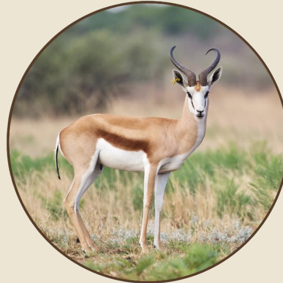
Lot: 301 Y23 17 6/8" at 3y 3m