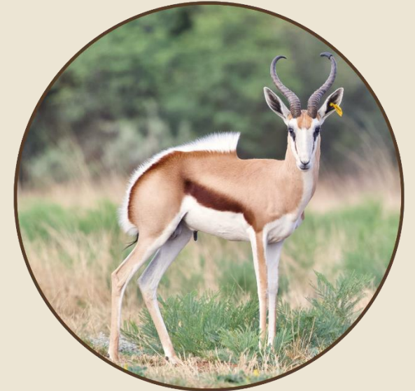
Lot: 323 Y10 16 1/8" at 3y