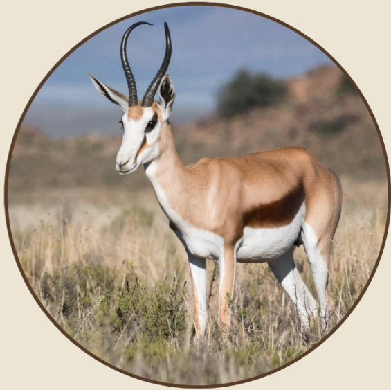
Lot: 017 Kalahari Springbuck Ewes 12"+