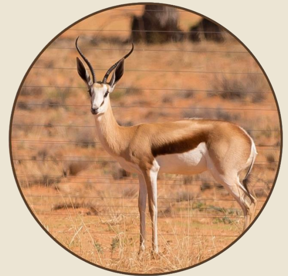
Lot: 267 & 275 Jules of The Karoo Genetics 0-12"