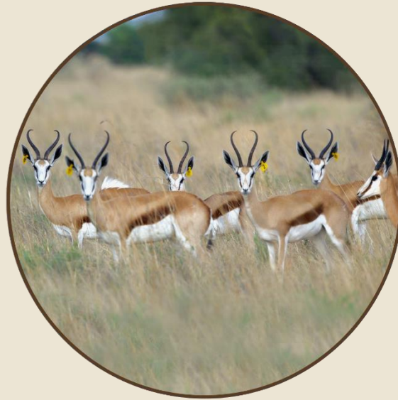
Lot: 018 Springbuck Ewes 12"+